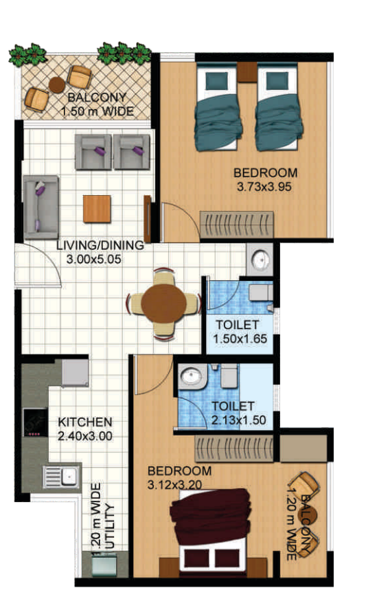
TYPE - B - 69.5 sq.mt. SINGLE BED UNIT