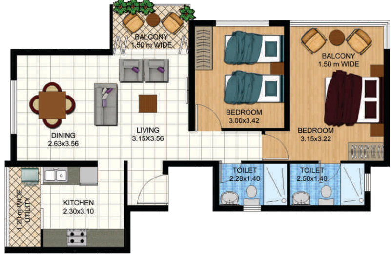
TYPE - A1 - 105 sq.mt. 2 BED UNIT